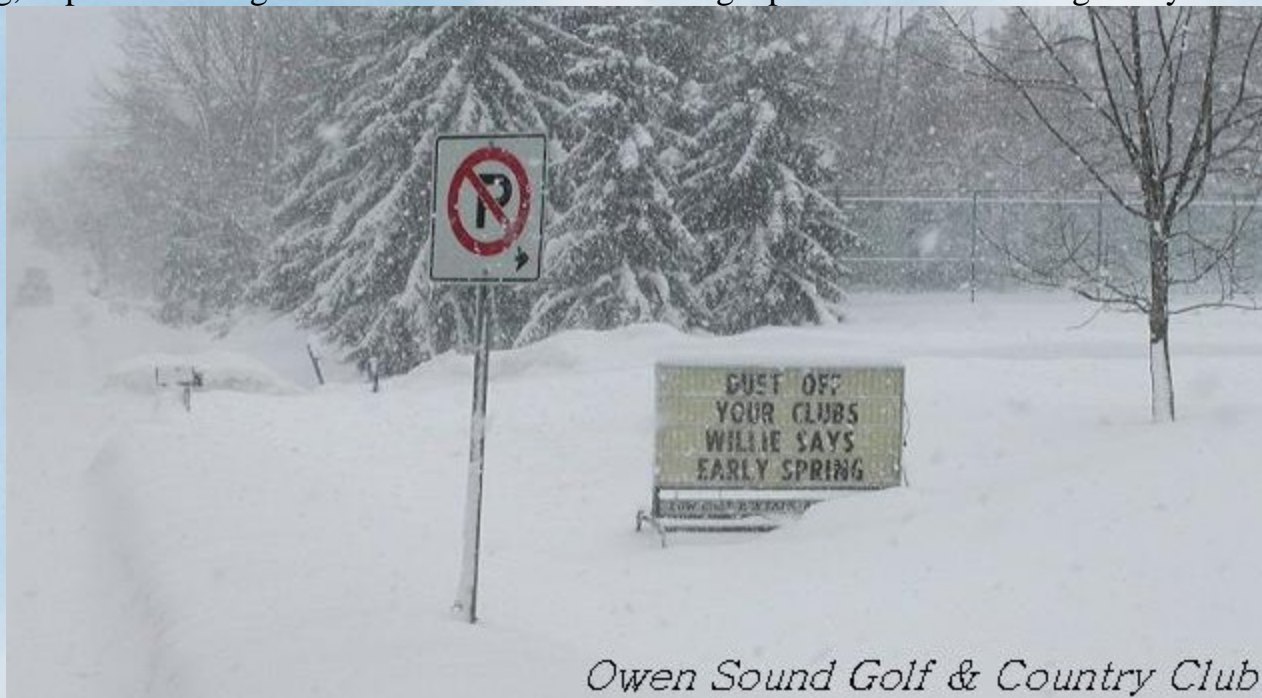
Owen Sound Golf & Country Club

Last month, we commented on our Wiarnton Willie's Early Spring prediction that obviously went wrong. Later during that week, heading into Owen Sound, after 77cm plus of snow and it still falling, I spotted this sign that I couldn't not resist taking a picture of and sending it to you: